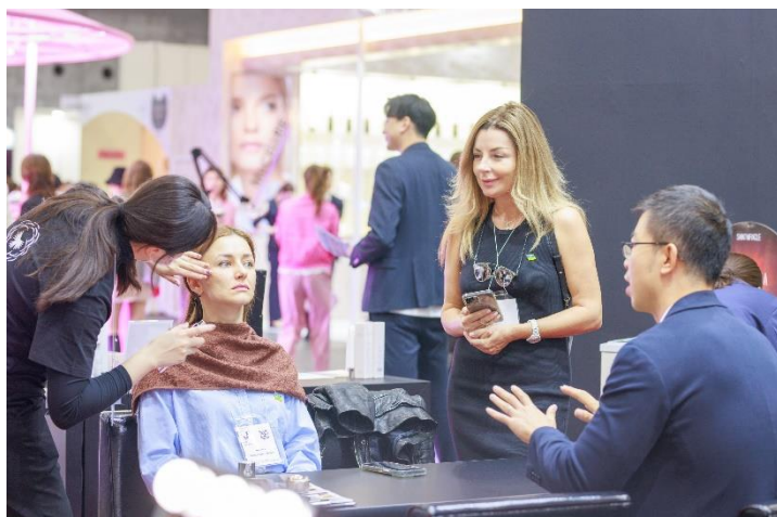
Beautyworld Japan Osaka 2023.

Osaka, 27 September 2024. Set to attract numerous key players for three days of business and insight exchange, Beautyworld Japan Osaka will reiterate its standing as the largest and most important trade fair for Western Japan's beauty industry. Taking place from 21 – 23 October 2024 at INTEX Osaka Halls 1 – 5 and 6B, the 19th edition will gather around 520 exhibitors from seven countries and regions, namely China, Hungary, Japan, Korea, Lithuania, Thailand and the US. The Korea and China Pavilions are key highlights from the international contingent, and will present innovative products and technologies for the first time to the Japanese market. This edition will also mark the debut of a new zone, 'Tasty', adding essential flavour to the show floor.